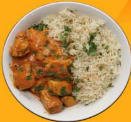
BUTTER CHICKEN + RICE + GULAB JAMUN $20