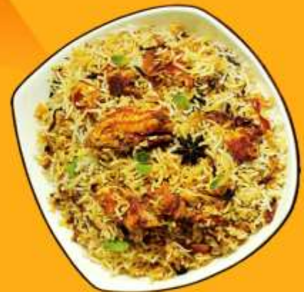
CHICKEN BIRIYANI + GULAM JAMUN $20