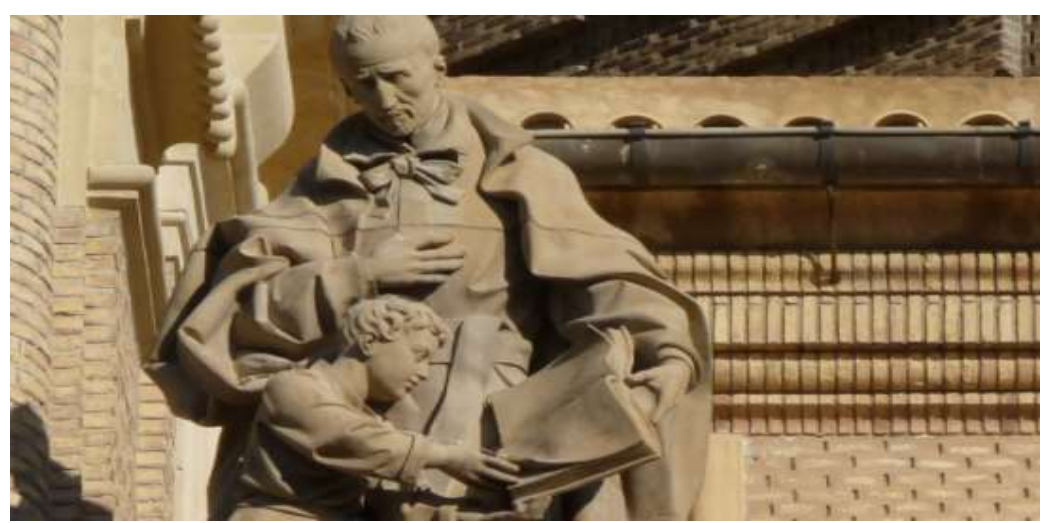
A statue of St.José de Calasanz in Zaragoza.

Quote: Joseph Calasanz, wise interpreter of the signs of the times, considered education, given in a "brief, simple and effective manner," the guarantee of success in the life of students and the leaven of social and ecclesial renewal. Moreover, he saw school as a new way of evangelizing and for this reason he wished religious and preferably priests to take on the task of teaching, committing themselves to offering the child an all-round culture, in which the religious dimension would be considered and lived in a profound manner. Calasanz consequently outlined the figure of the priest, teacher of little ones and of the poor, while at the same time raising to ministerial dignity an office considered by his contemporaries as lowly and of little prestige. ~Letter from Pope John Paul II to the Superior General of the Piarist Fathers