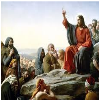
Luke 6:17, 20-26

Jesus came down with the twelve and stood on a stretch of level ground with a great crowd of his disciples and a large number of the people from all Judea and Jerusalem and the coastal region of Tyre and Sidon. And raising his eyes toward his disciples he said: