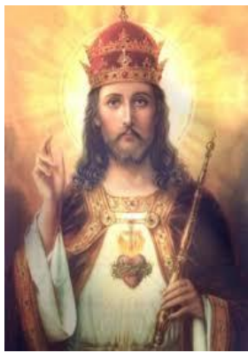
Solemnity of Our Lord Jesus Christ, King of the Universe